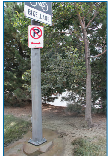
Application of corrosion-resistant coating